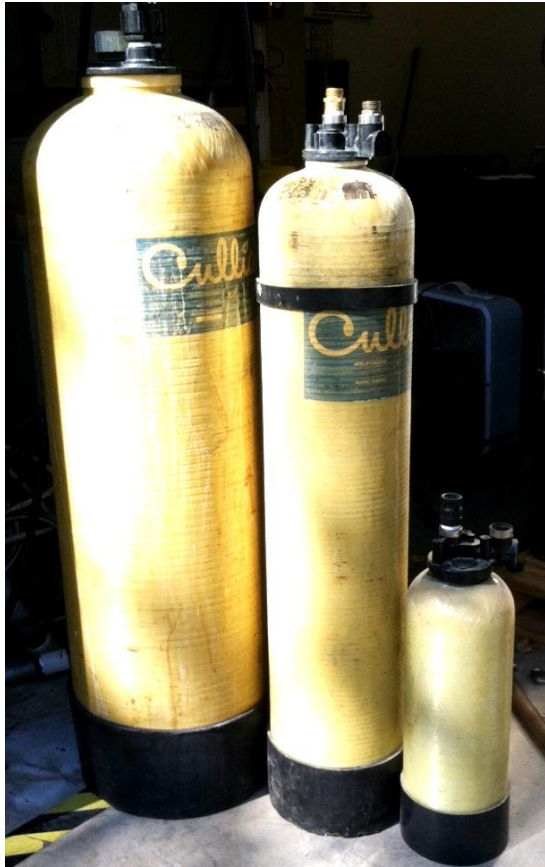
Photo 1 Fiberglass absorptive media tanks (2.5ft 3 , 1.5ft 3 , 1/4ft 3 shown)

Tanks can be purchased outright or, in some areas, can be rented from your media supplier. In either case, it is recommended to have a spare set of tanks available to swap out when one set expires. Plumbing them in parallel allows a quick and easy change over. Many cleaners can give warning before the tank completely expires if equipped with the proper sensors and software.