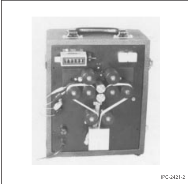
Figure 2 Fatigue Ductility Flex Tester

Note: For the ductility test, it is important that the specimens fail between 30 and 500 cycles. The 6.35 mm diameter is suggested for mandrels but, for some samples, different mandrel diameters might be necessary. Larger mandrel diameters result in longer cyclic life and smaller diameters result in shorter life.