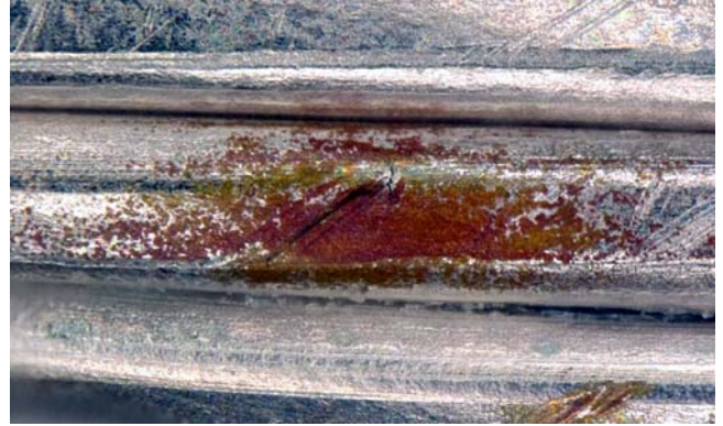
Figure 1-1 Red Plague (Cuprous Oxide Corrosion)

Chemical Attack Exposure to chemicals present in the environment (oxygen, sulfur compounds, salt, etc.) may result in corrosion and corrosion by-products that attack and compromise the mechanical integrity of the silver coating. Common